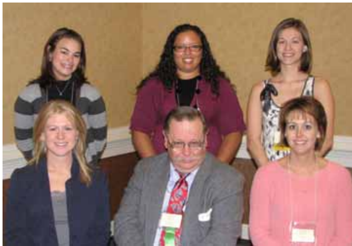
2009 - 2010 Appalachian District officers